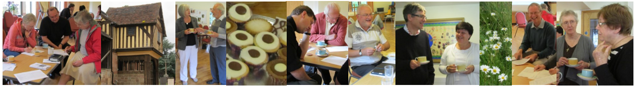
Chaplains' AwayDay at St John's, Berkswell