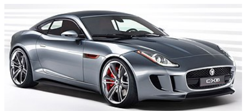
The Jaguar C-X16 concept - upon which the aluminum-bodied 2013 Jaguar F-Type is based.

The commitment and passion of many at the plant has been inspiring.